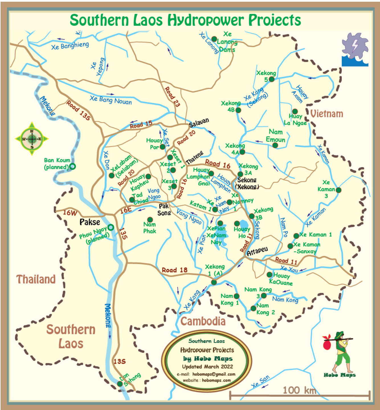
Concept image of what the Nam Kong 1 Reservoir may look like is shown below: