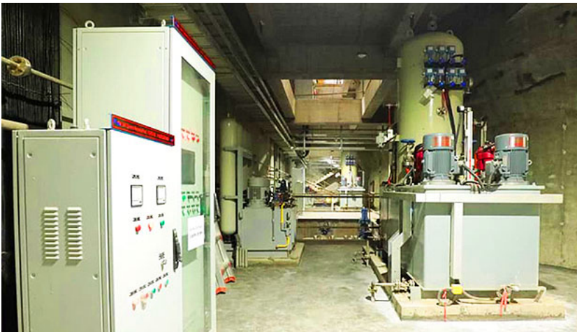
Nam Kong 1 tunnel construction image below: