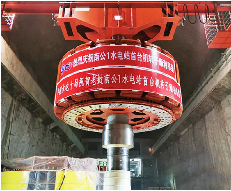
Nam Kong 1 apparatus images below: