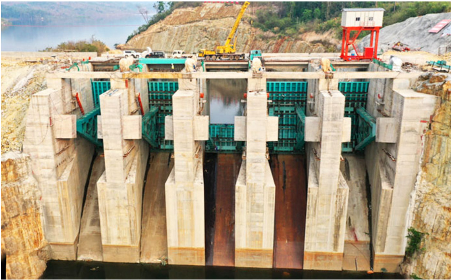
Nam Kong 1 construction site area image below: